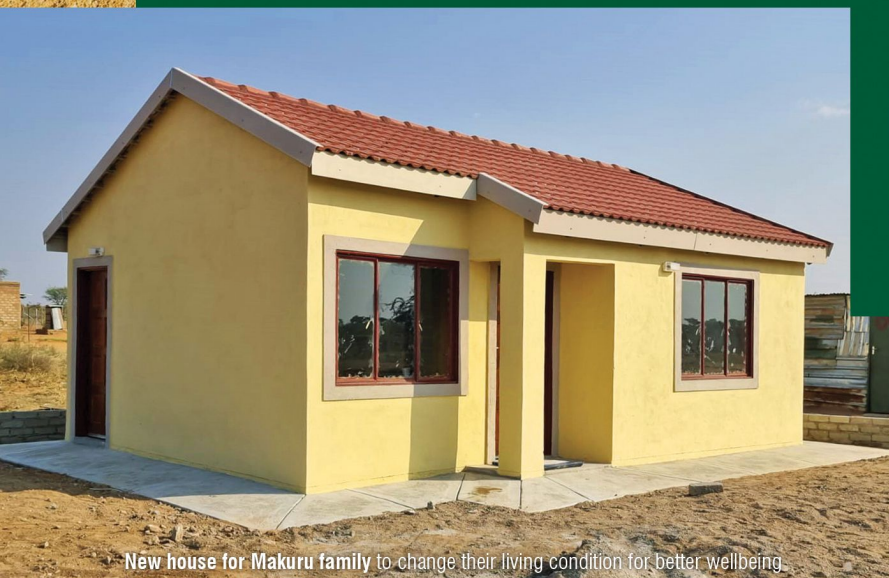
New house for Makuru family to change their living condition for better wellbeing.