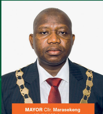
MAYOR Cllr. Marasekeng Hlalithi Moimana ANC