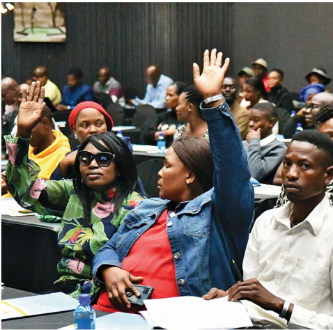
Ward Committee members during Induction workshop at Bela Bela Forever Resort