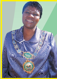
Mayor Cllr Mmakola Mashimole Yvonne