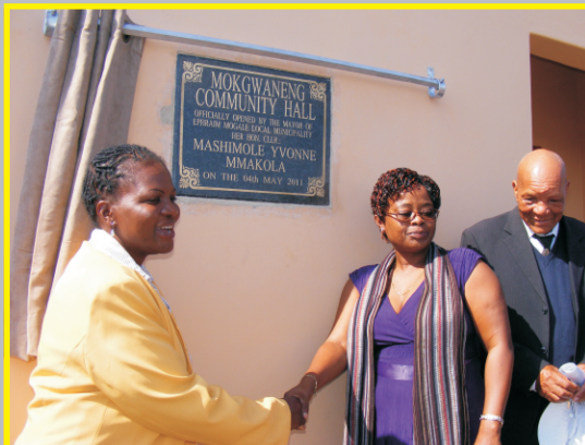
Ward Councilor thank the Mayor after unveiling the plaque during the official opening of Mokgwaneng Community Hall