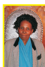
Kgoshigadi Rahlagane MP Moganyaka