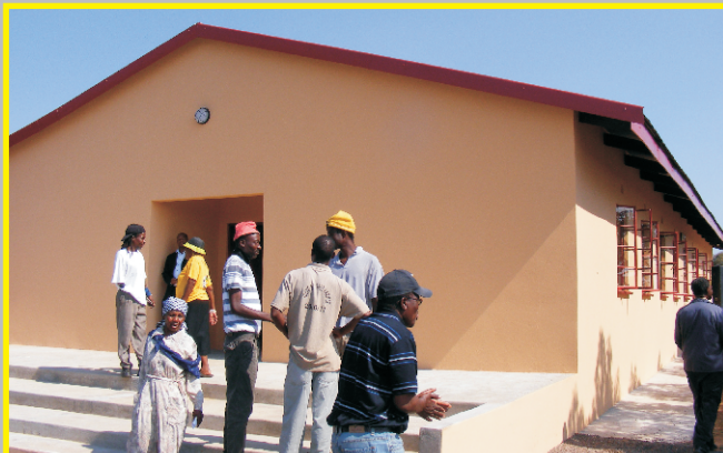
Young and old outside the newly revamped Mokgwaneng Community Hall during the official opening