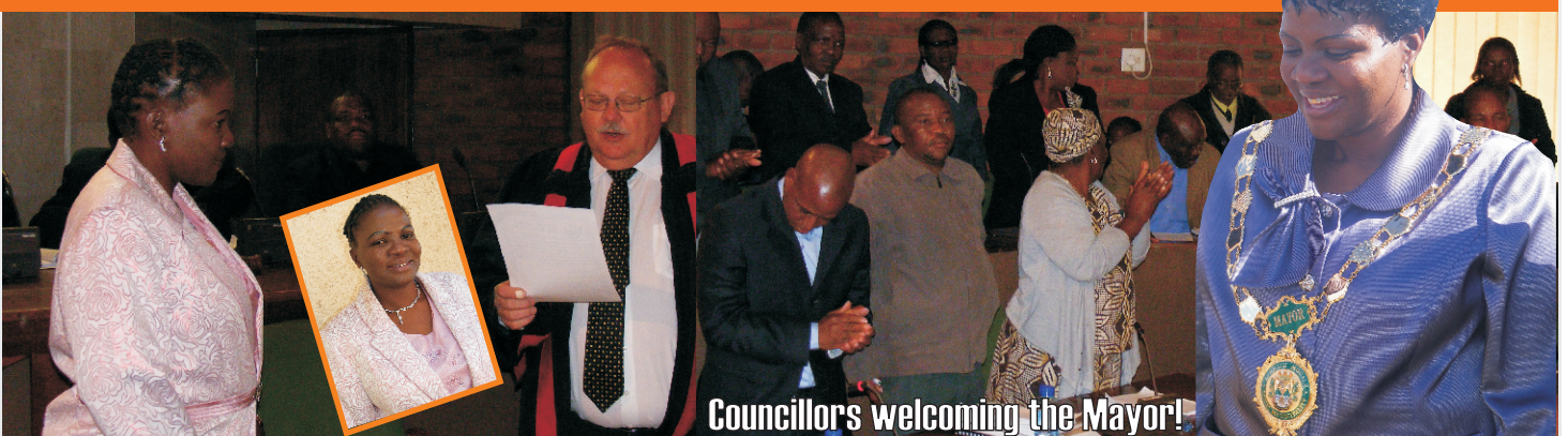
Councillors welcoming the Mayor!

All Councillors including the Mayor elect, speaker and chief whip signed their statement of oath in front of the Magistrate HP Van Der